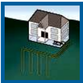
Closed Loop Vertical System

Other types of geoechange systems include standing column wells, community loops and hybrid systems.