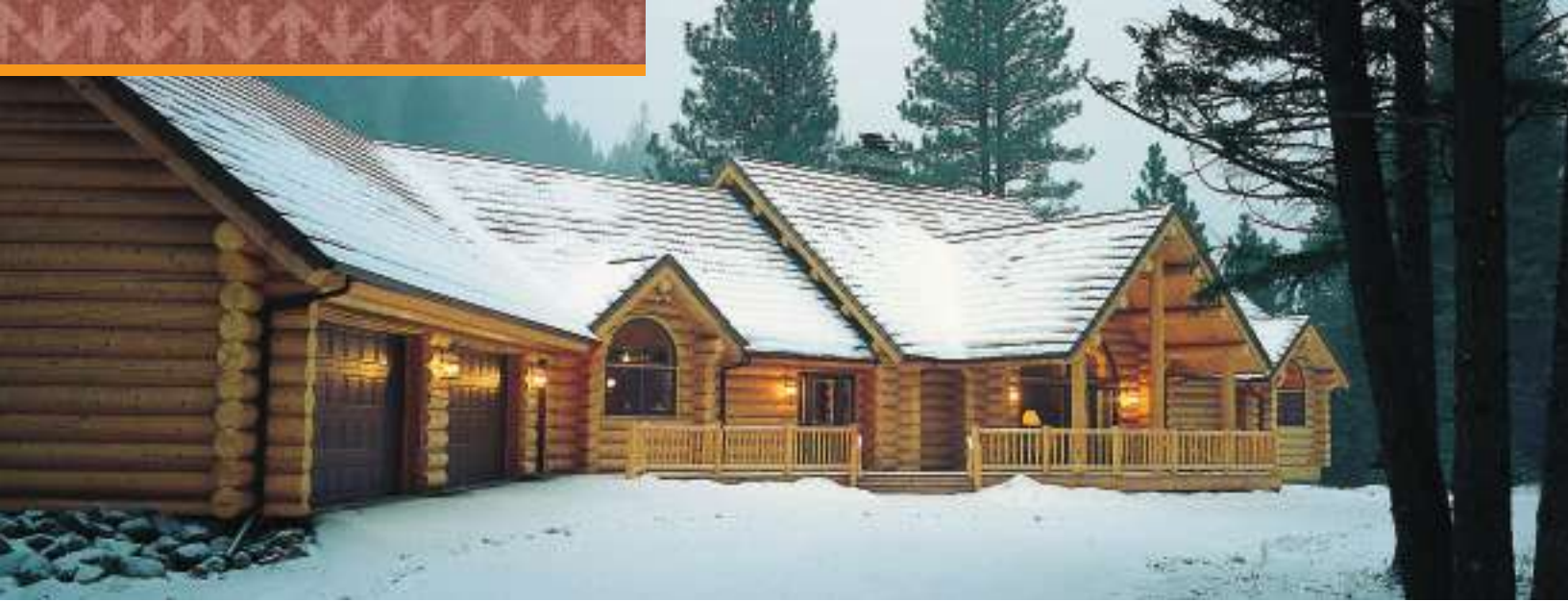
Log home, Victor, MT