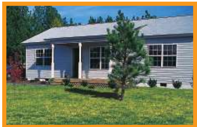
↑ Habitat for Humanity, Moore County, NC

You need not be a rocket scientist to understand and appreciate the technology behind geoexchange heating and cooling. It employs basic plumbing equipment — pipes, pumps, valves, heat exchangers, fans and compressors. Routine maintenance consists of changing the air filters. There's no furnace or chimney to clean. And since there's no flame, geoexchange systems operate at lower temperatures, which helps the components last longer. The underground pipes, for example, are warranted by some manufacturers for up to 50 years.