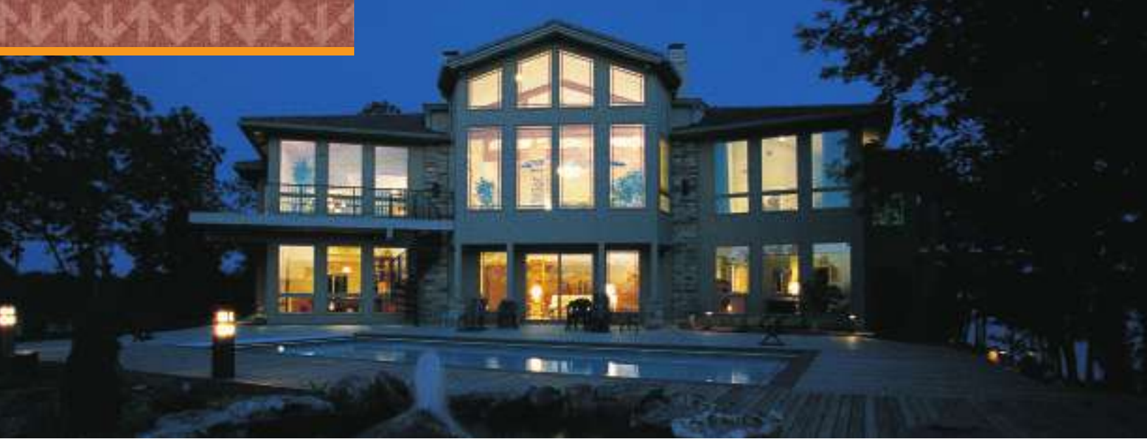
Lee's Summit, MO

Comfort is constant in a home with geoechange technology. Humidity levels are ideal. There's no "blast" of hot air or "cold blow." Temperatures don't fluctuate. Thermostats don't need to be adjusted. You just set it, and forget it. A geoechange system ensures precise temperature control in every room, yet consumes far less energy than traditional systems.