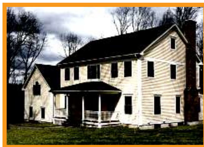
↑ East Hampton, CT

Many banks and lending institutions now permit home buyers to qualify for larger mortgages if they're purchasing a home that utilizes a geoechange system. The reduction in monthly energy bills more than offsets the slightly higher mortgage payment. The greater predictability of those monthly energy costs enables home buyers to plan their finances better. And over time, a geoechange system can add considerable market value to the home.