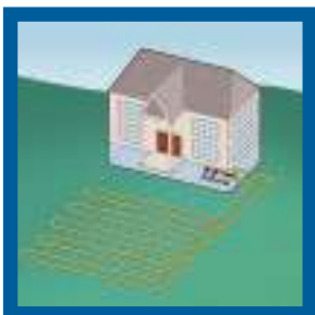
Closed Loop Horizontal System