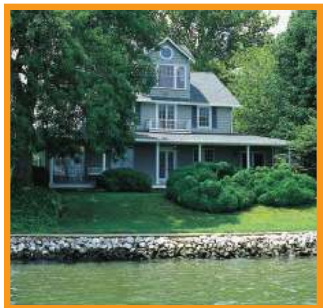
↑ Galesville, MD